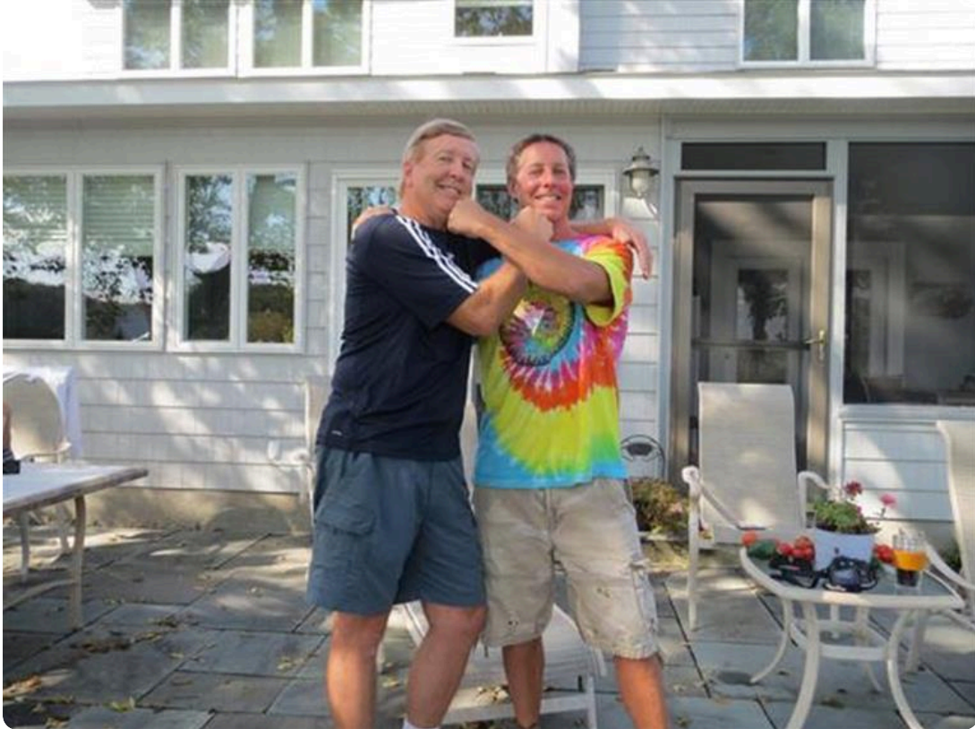
"Always, having a Good Time"